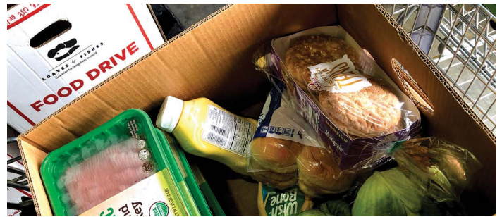
A glimpse into a home delivery food box